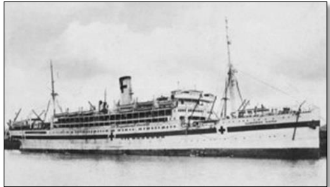
Figure 3: HM Hospital Ship Llandovery Castle

By February 1918 he was also diagnosed with dyspnoea (shortness of breath) and he continued to have pain in his back, hip, groin and thigh on exertion. The general weakness he suffered from was joined by daily headaches. His condition remained much the same through the spring of 1918. By the time he was invalided to Toronto he had also lost 10 pounds. When he was discharged, his general condition was listed as good, but he still had difficulty going up stairs and his nephritis added to his weakness. He was given a medical discharge as physically unfit for service.